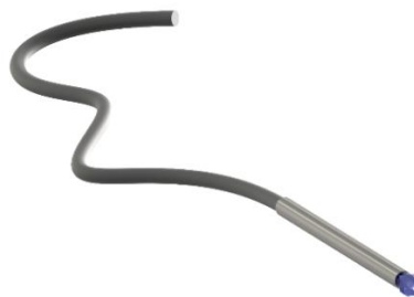
GRIN-Lens Ø 1.00 mm / Prism 1.00 mm Stainless Steel Tube Ø 1.20 mm Fiber