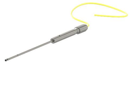
GRIN-Lens Ø 1.00 mm / Prism 1.00 mm Stainless Steel Tube Front Ø 1.20 mm Stainless Steel Tube Back Fiber